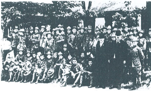
Above are Boy Scouts in 1911 in Greensboro.

Lord Robert Baden-Powell started the Boy Scout movement in England in 1907. The Boy Scouts of America was incorporated in 1910 under the leadership of William D. Boyce. With the aid of Ernest Thompson Seton, Daniel Carter Beard and James E. West the BSA grew into the country's greatest youth organization. Learn about this rich history.